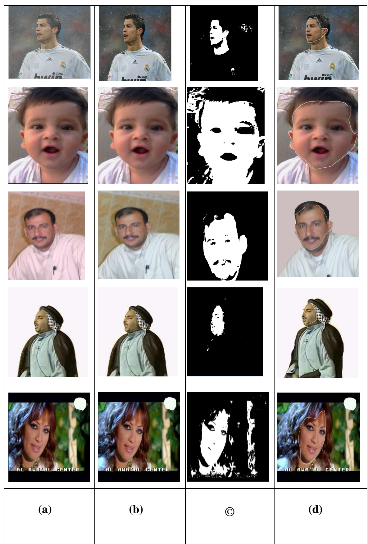
Figure 1 (a) Original image (b) Remove Affect (c) Skin Segmentation (d) Result of face detection