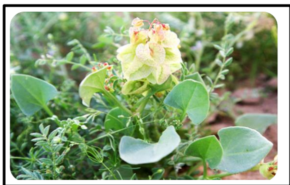
Figure1. Target plant Rumex vesicarius L.

Leaves of R. vesicarius and Z. coccineum were collected from Ramadi, University of Anbar, Iraq (Fig.1 and Fig.2). Collected leaves were washed thoroughly under tap water to remove chemicals materials and dust. the leaves of plants were dried by incubation in oven at 37°C for one day. Extraction processes were performed on leaves of plant in the laboratories of Desert Studies Center after drying the leaves of plants by using methanol solvent and Aqueous Extract.