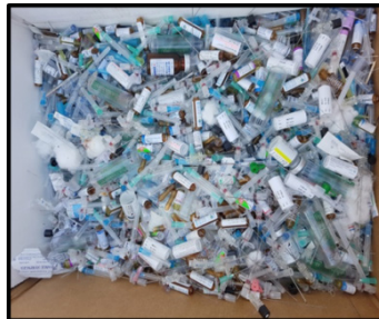
Figure (2) Sharp medical waste