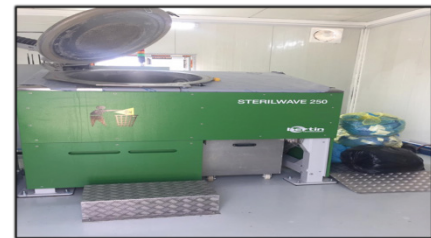
Figure (3) shows the waste disposal device Steril wave 250