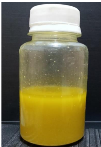
Form 3. oil produced from bacteria Pseudomonas fluorescens