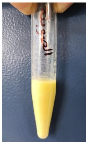
Form 2. one-cell oil greenhouse test