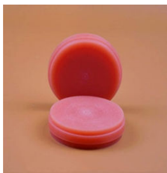
Figure 1A: Compact acrylic (block).