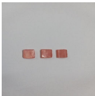
Figure 1B: Image of samples.