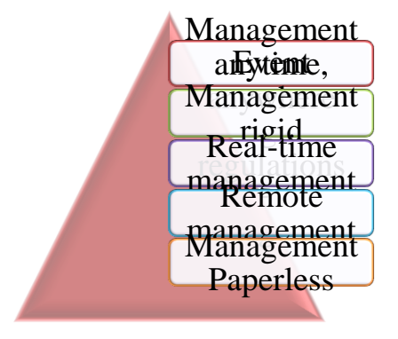
Figure (2) E-management dimensions