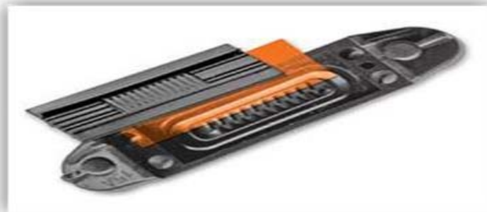
Figure 2: Nano-Root -Guard (ASSIF)

The Nano-drippers were obtained from the Turkish company GeoFlow. The latest form of the Nano-Root guard is the (VERD), ASSIF, GFPC, VARDIT, where each dripper is used with a type of plant. What was used in the research is type (ASSIF) Figure 2, which is used for crops, their discharge varies according to the operating pressure. It usually operates at low operating pressures from (0.2 to 2 bar), and has a diameter of 16 mm. It contains a Nano-leachate membrane that contains 109 \text{ cm}^{-2} holes and the distance between droplet and another is 0.35 m, calibrated. The dripper at a pressure of (0.2 bar) yields a 1.6 \text{ liter hour}^{-1} .